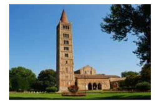
Digitalization of the historical archive of the Pomposa Abbey