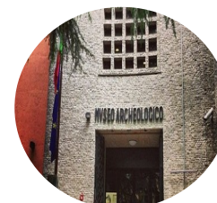
Arheološki muzej Adria